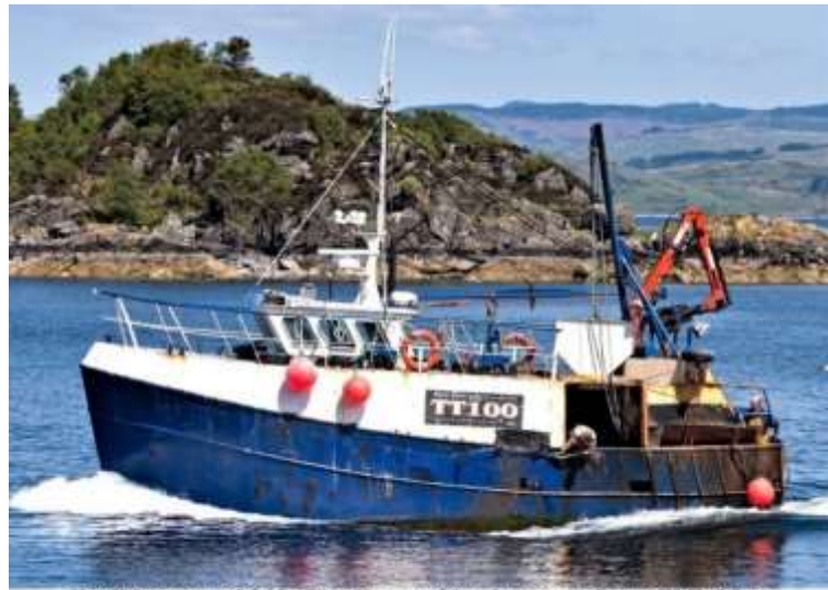
Until January 2018, The Nancy Glen , last trawler still fishing with a Marquis family connection.